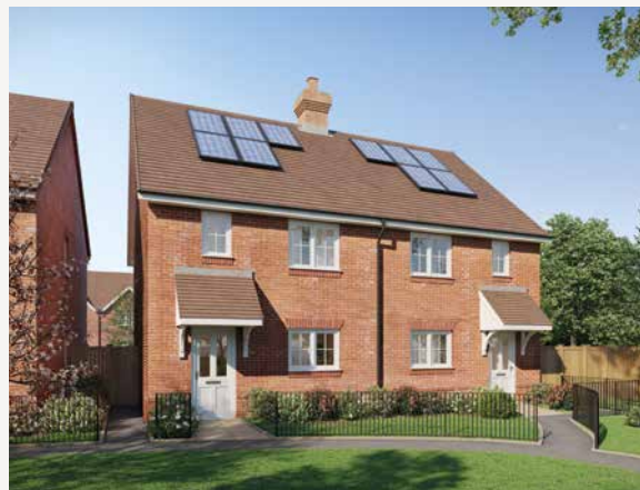
Computer generated image of The Madehurst, indicative only